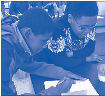
Bard Citizen Science, a science literacy program undertaken by all first year Bard College students, visits the Intermediate School each year. The Bard students helped these 6th graders work on an experiment to understand the states of matter.

Additional information about the budget is posted on the district’s website, www.hudsoncityschooldistrict.com . For further information, please call the District Office at 828-4360, Ext. 2100.